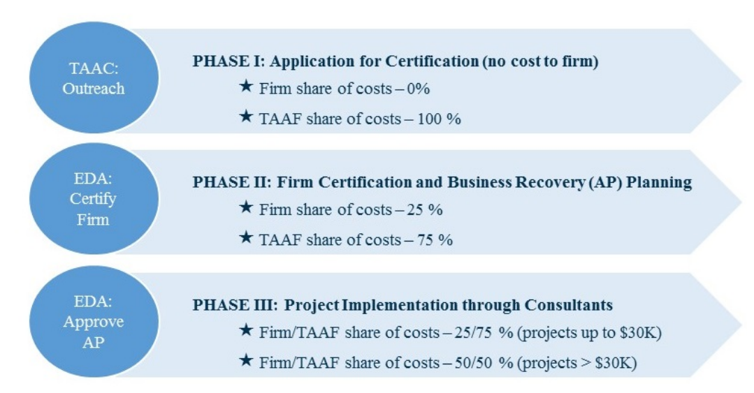
Exhibit 3: Program Phases

There are three main phases to receiving technical assistance under the TAAF program: (1) petitioning for certification, (2) recovery planning and (3) AP implementation.