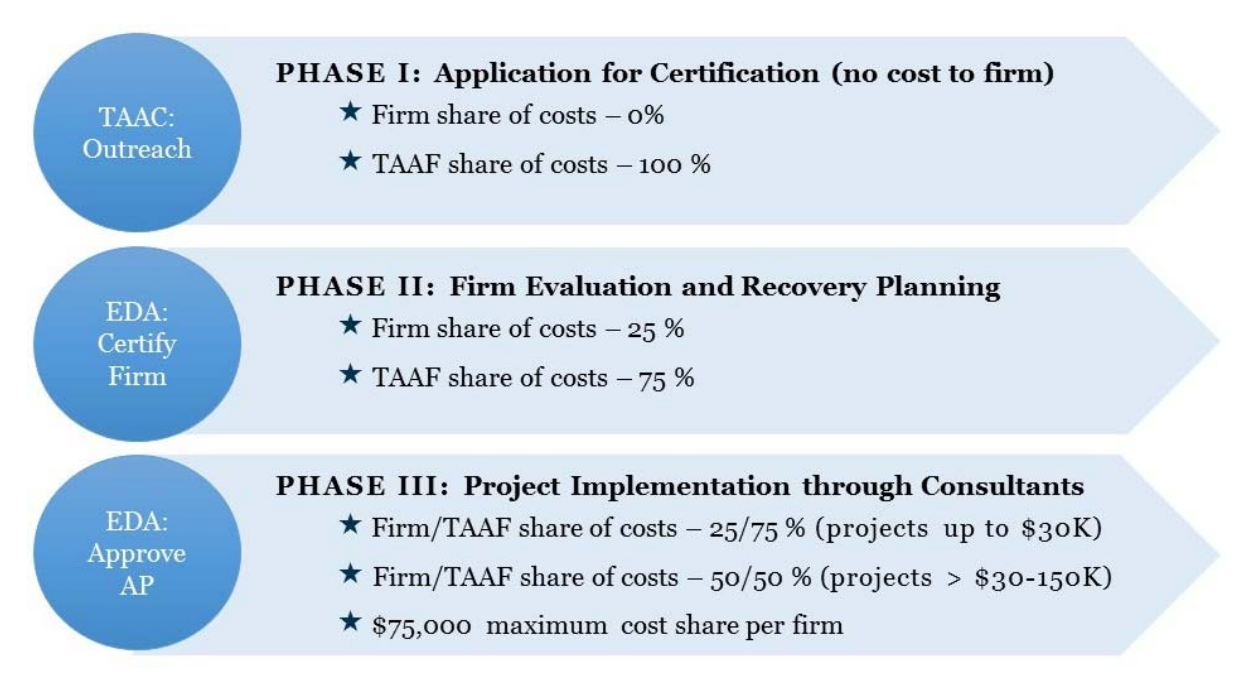
Exhibit 3: Program Phases

There are three main phases to receiving technical assistance under the TAAF program: (1) petitioning for certification, (2) recovery planning and (3) AP implementation.