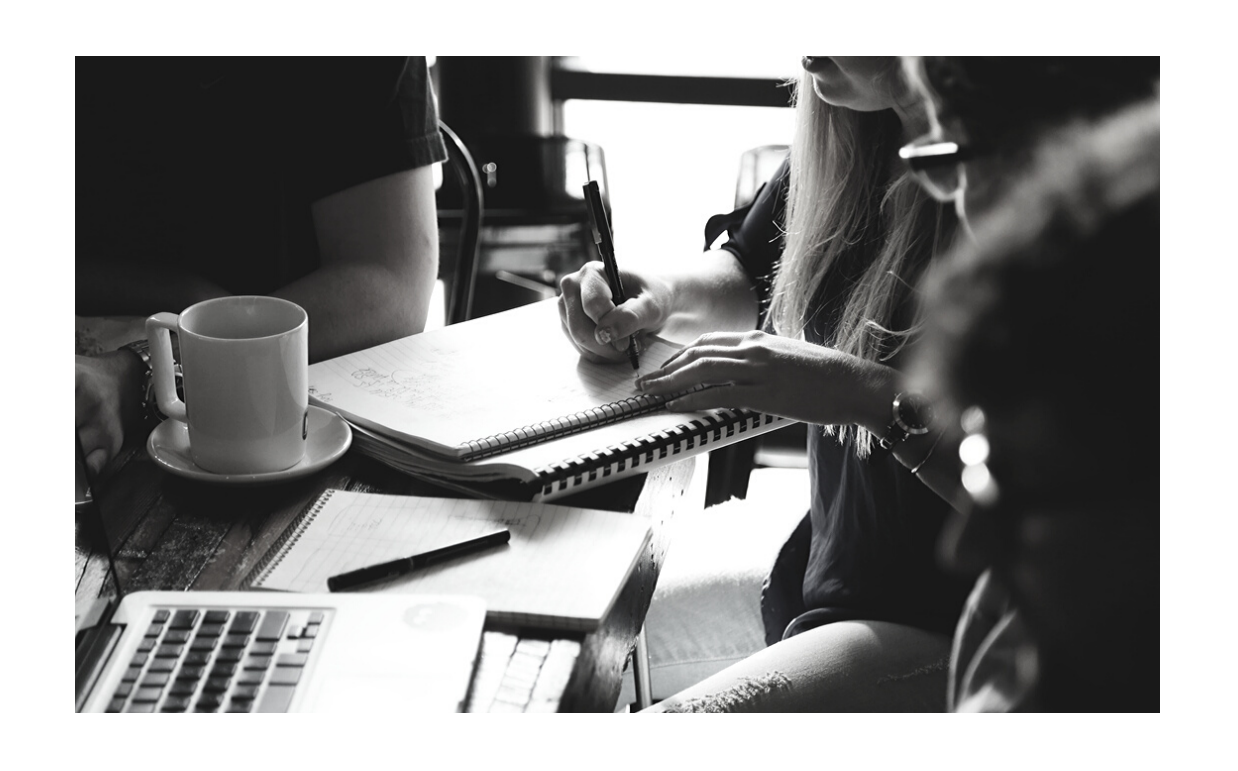
APRIL 29 TO JUNE 14 Full Application window is open