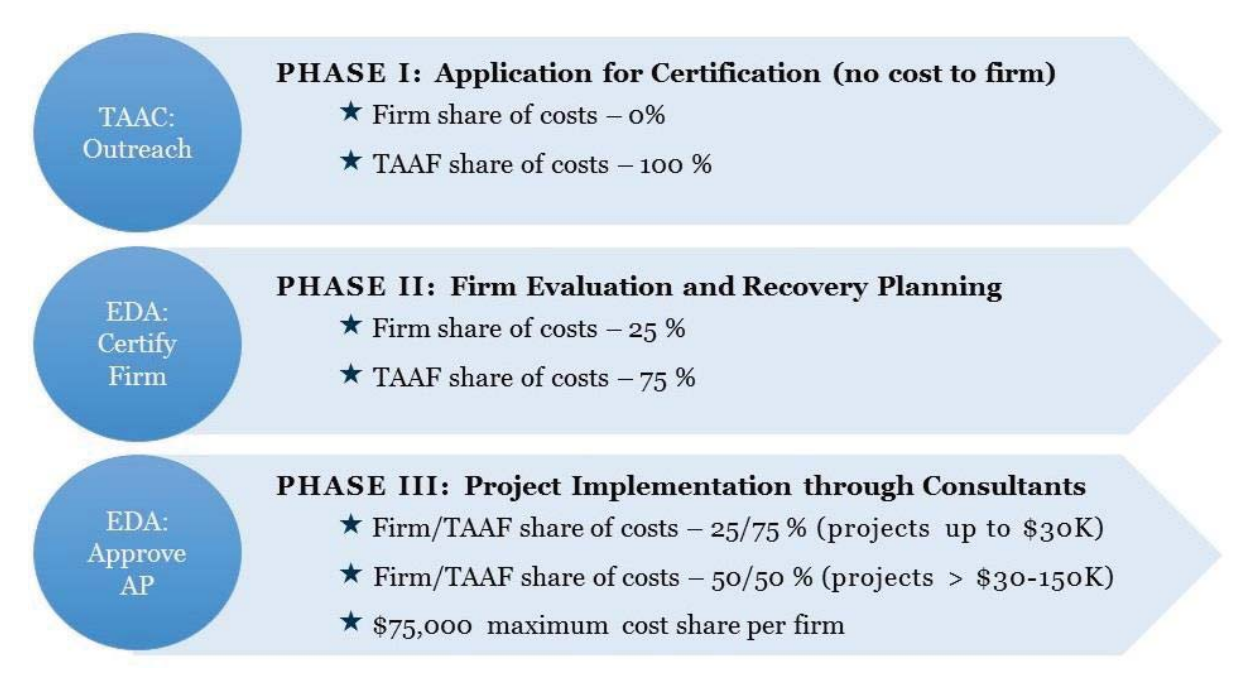
Exhibit 3: Program Phases

There are three main phases to receiving technical assistance under the TAAF program: (1) petitioning for certification, (2) recovery planning and (3) AP implementation.