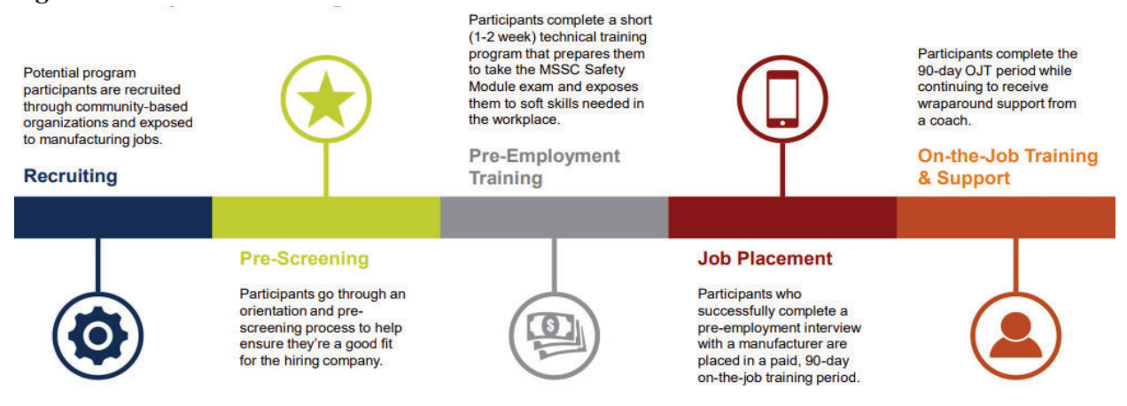
Table 4: Program Design Plan

<u>Existing Program Assets and Problem to Be Solved:</u> OMA has begun to develop TA capability to support ISPs to adopt earn-and-learn programs including the ELLE program. Toolkits and TA assets we have developed for ISP use include: