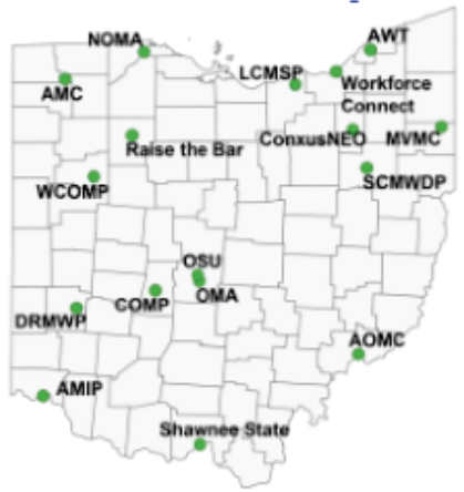
Figure 2: Backbone Org. Map

backbone organizations in this application are OMA-endorsed ISPs. Five of the ISPs (AMC, AMIP, BESTOhio, WCOMP, and the Ohio State University/OSU) are emerging and/or in the process of obtaining endorsement.