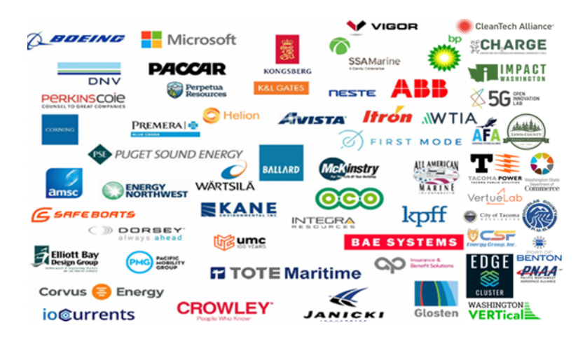
Figure 3: Key Industry Members and Employers Engaged

PNW region; it will assemble members of Maritime Blue (125 members), and other participating organizations including CTA (1,100), Aerospace Futures Alliance (1,400), Renewable Hydrogen Alliance (75), Blue Sky Maritime Coalition (55), Impact WA NIST-MEP, and asset partners—totaling 3,000+ collective members.