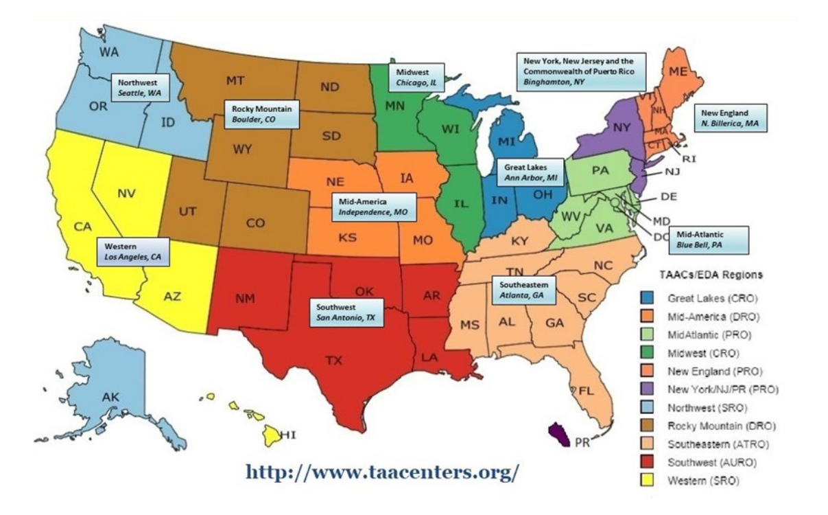
Exhibit 2: TAACs and their Service Areas<sup>7</sup>

Commonwealth of Puerto Rico. Import-impacted firms work with the TAACs in a publicprivate collaborative framework to apply to EDA for certification of eligibility for TAAF assistance and to prepare and implement strategies through the APs to guide their economic recovery.